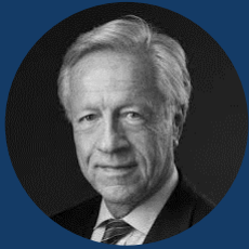
Mayor Allen Joines