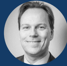
Hlynur Guðjónsson Consul General & Trade Commissioner, Consulate of Iceland in New York